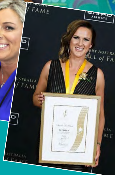
Right: Sharelle's induction into the Sport Australia Hall of Fame in 2016.