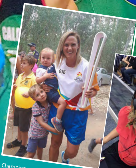
Champion netballer, Sharelle McMahon carrying the Queen's baton for the Commonwealth Games near Echuca with her children.