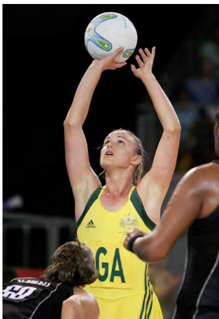
Sharelle in action for the Australian netball team

Sharelle has participated in the pinnacle of the game, representing Australia in the Commonwealth Games between 1998 and 2010, winning gold in 1998 and 2002, and silver in 2006 and 2010. She played 118 games for Australia, won two World Championships, and was the Australian flag bearer for the opening ceremony of the 2010 Commonwealth Games in Delhi. In 2016, she was inducted into the Australian Sport Hall of Fame. She currently works as a specialist coach for the Melbourne Vixens and commentates on the sport for Channel 9.