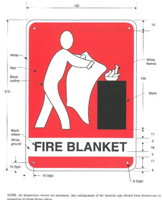
DIMENSIONS IN MILLIMETRES FIGURE 6.1 TYPICAL FIRE BLANKET LOCATION SIGN

Remember, if you need any assistance speak with your WHS Consultant at Catholic Safety Health & Welfare SA.